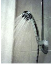
take a shower