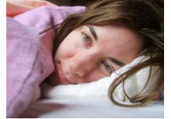
go to bed